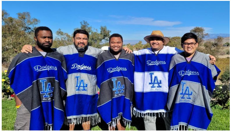
The Brothers supporting our favorite Baseball Team, the LA Dodgers.