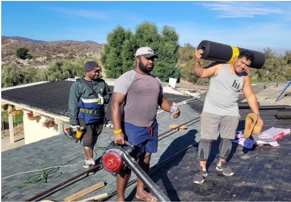
The Brothers working on the roof of the Main House here in Hemet, California.