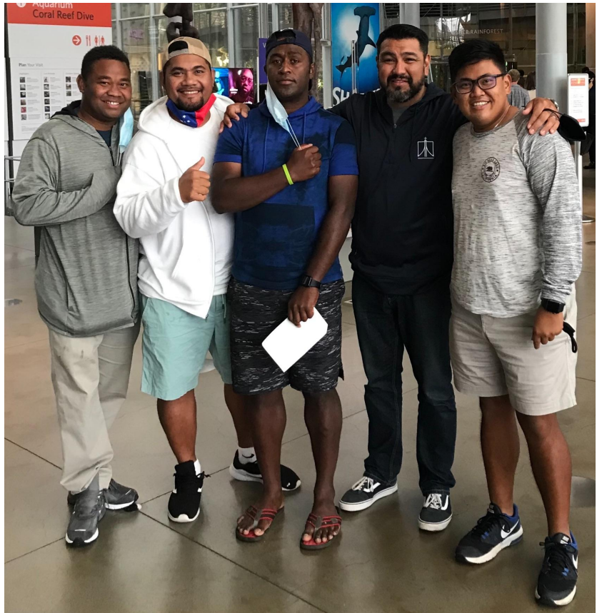
Sunday Outing with the Brothers.