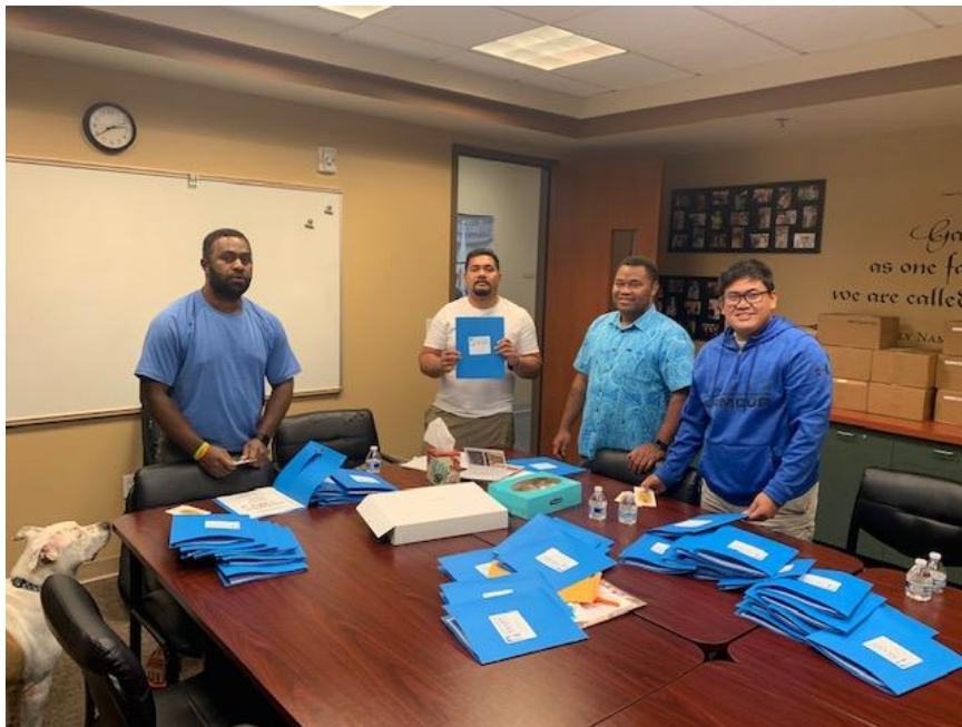
The Brothers preparing the materials for the annual HNM School Faculty Retreat.