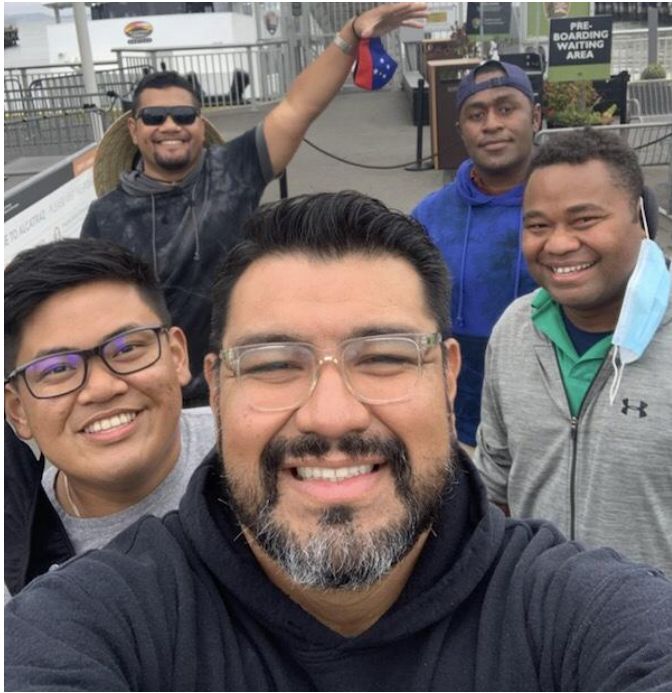
Selfie with the Brothers