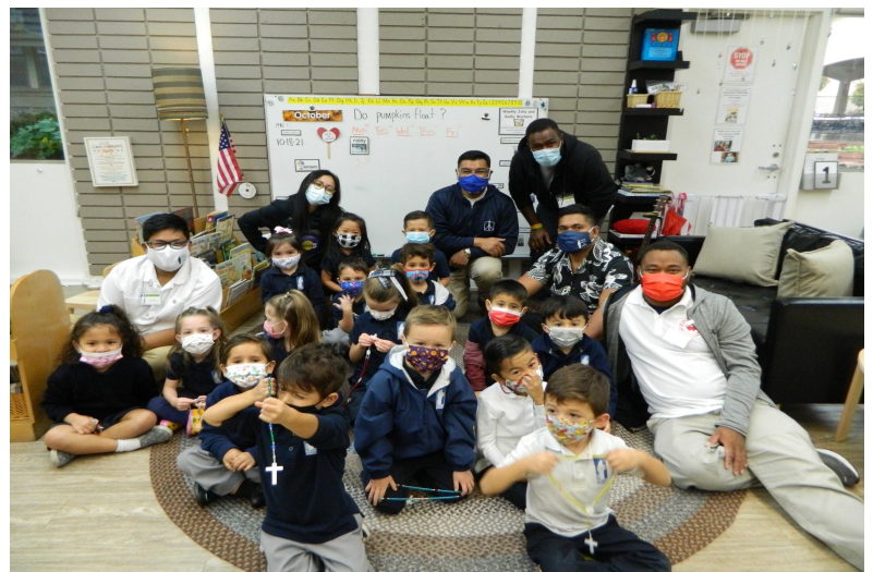
The Brothers talking with the HNM students about the Rosary.