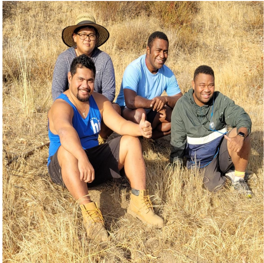
The Brothers doing some landscaping around the property.